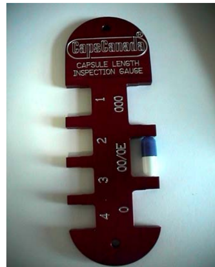
(Closed Length Gauge)